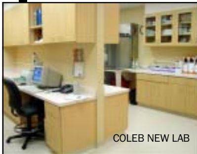
COLEB NEW LAB