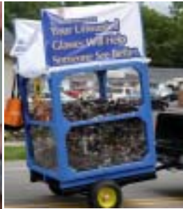
Glasses collected by the Bellbrook Lions to donate to VOSH. Guess how many?